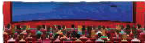
half an hour from now

Half an hour from now, the cinema will be full. Everyone will be watching the film.