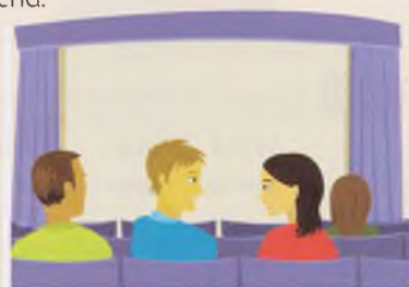
The film hasn't started yet .