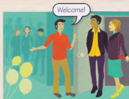
They have just arrived .